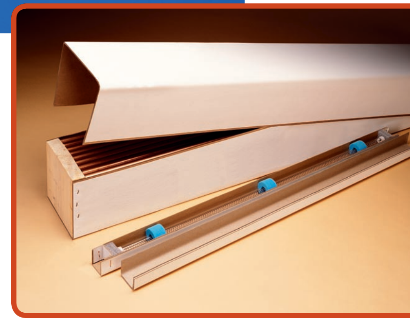
Reddi-Crate's superior strength prevents damage to products from metal piping to lightweight, fragile glass products.