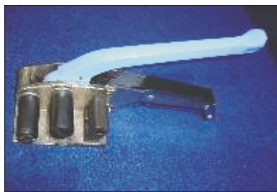
Manual Tensioner for 32 mm strap