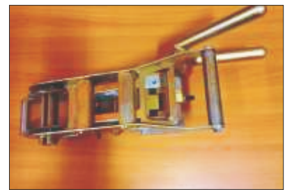
Manual Tensioner for 40 mm strap