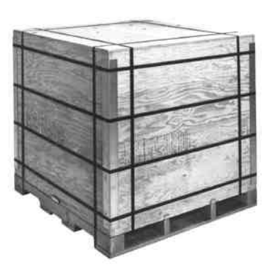
Signode steel strapping and plywood can be combined to fabricate 300 gal. (1140 l) storage containers used to store and ship a myriad of industrial products.

Zinc finish strapping is waxed and has a zinc enriched coating to provide outstanding resistance to rust. Available in a variety of Apex and Magnus sizes, it has the same improved tension transmission characteristics as the painted and waxed strapping. Zinc finish protects where it is needed most—at points of surface damage and scratches.